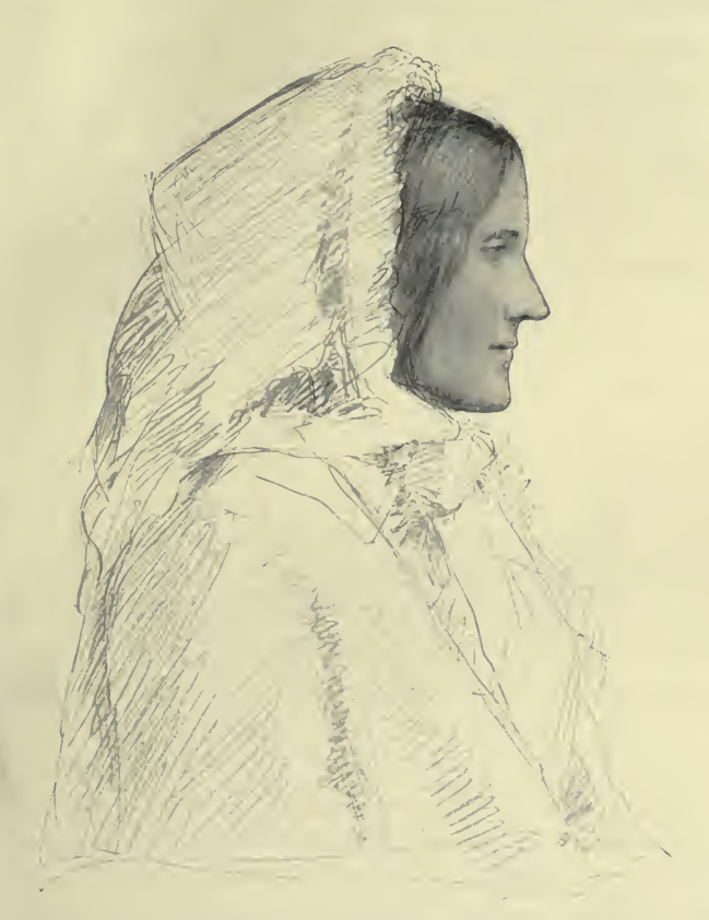
GEORGINA TOLLEMACHE, AFTERWARDS LADY MOUNT TEMPLE.