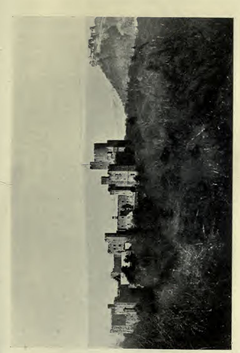
PECKFORTON CASTLE AND BEESTON CASTLE BEYOND, CHESHIRE.